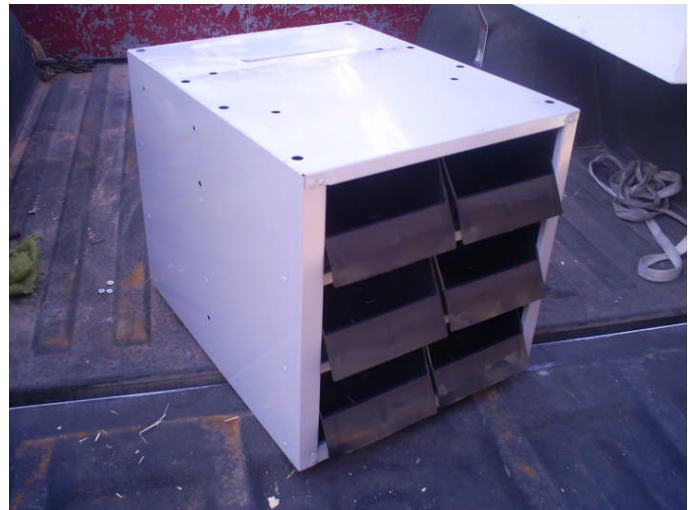
Bins hold (6) drawers each.

Dimensions: 12 3/4" wide X 12 7/8" tall X 16 1/4" deep. Stackable.