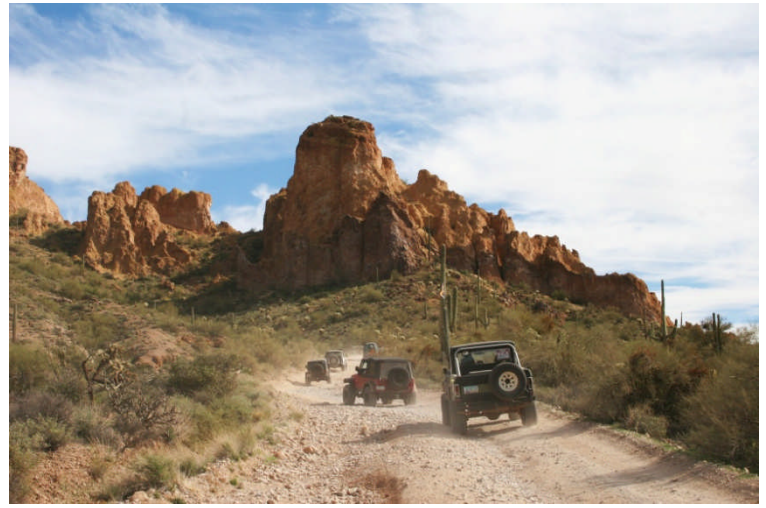
Martinez Canyon Road

At 9:30 am our group of 7 vehicles, 2 classic Broncos, 1 classy "Zuk", and 4 Jeeps made their way down Price Road thru Box Canyon and past Amy's Campout, to the start of Jack Handle Trail.