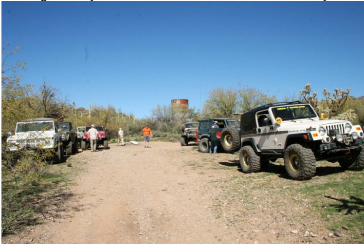
We made our way back to the start of Jack Handle from the Martinez Canyon side of the trail and had lunch where the old windmill once stood.