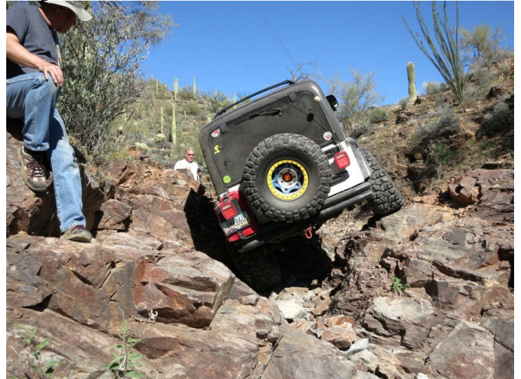
Clete & Randi going over "Thunderpool"

The group continued up the rocky wash to a series of rocky obstacles, one of which was called "Thunderpool" and or "Double Trouble" When we reached this major obstacle, we thought we met our match, but Mike said it was doable.