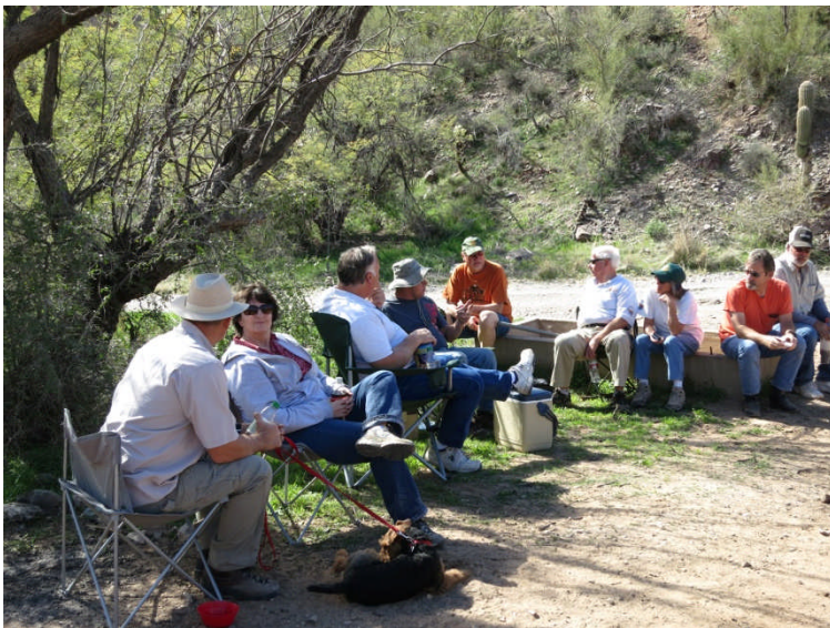
You could not have asked for better weather. We would have enjoyed a longer a lunch break, but there was still more trail to conquer!