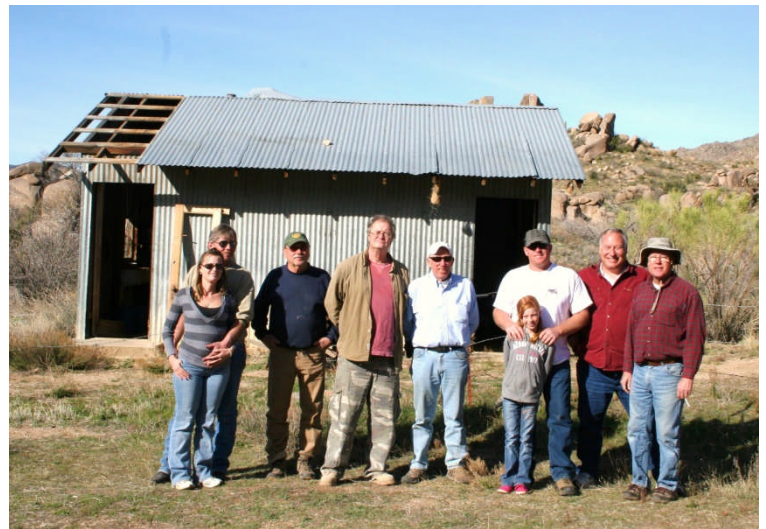
After 4 hours of challenging trail, the line shack, which marks the end of the road, was a welcome sight!