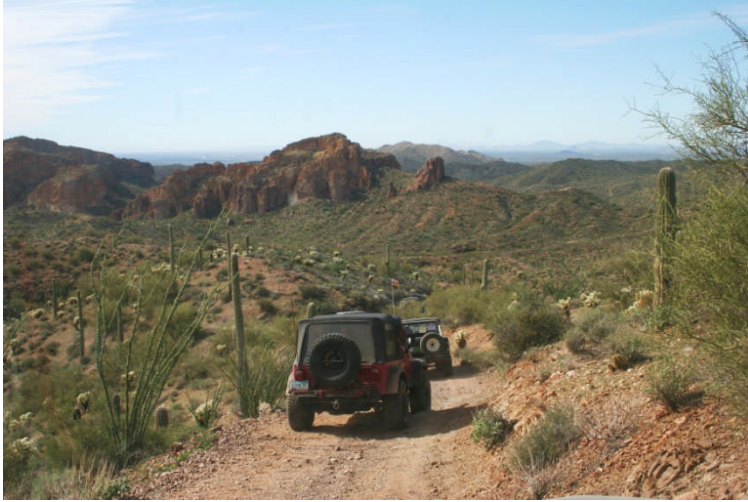
Working our way back down to the road to Martinez Canyon.