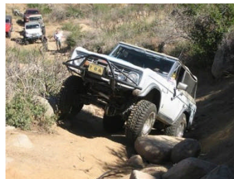
Mud Spring (November 2007)