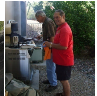
Ice Cream Social (August 2008)