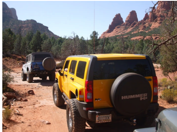
Our first stops, Submarine Rock and Chicken Point.